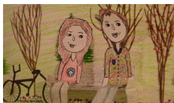
Saved from carbon dioxide - saved our planet as we know it.